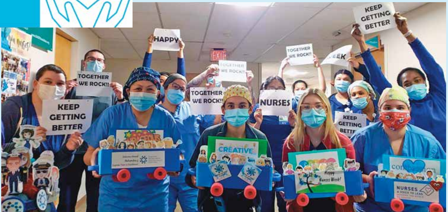
Jersey Shore University Medical Center honored its nurses with team member avatars riding the "Mehandru 5 Express Train to Excellence."