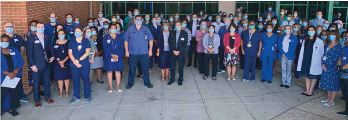
Day of Remembrance at Mountainside Medical Center