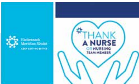
Left: All across the network, we appreciate our nurses and nursing team members.