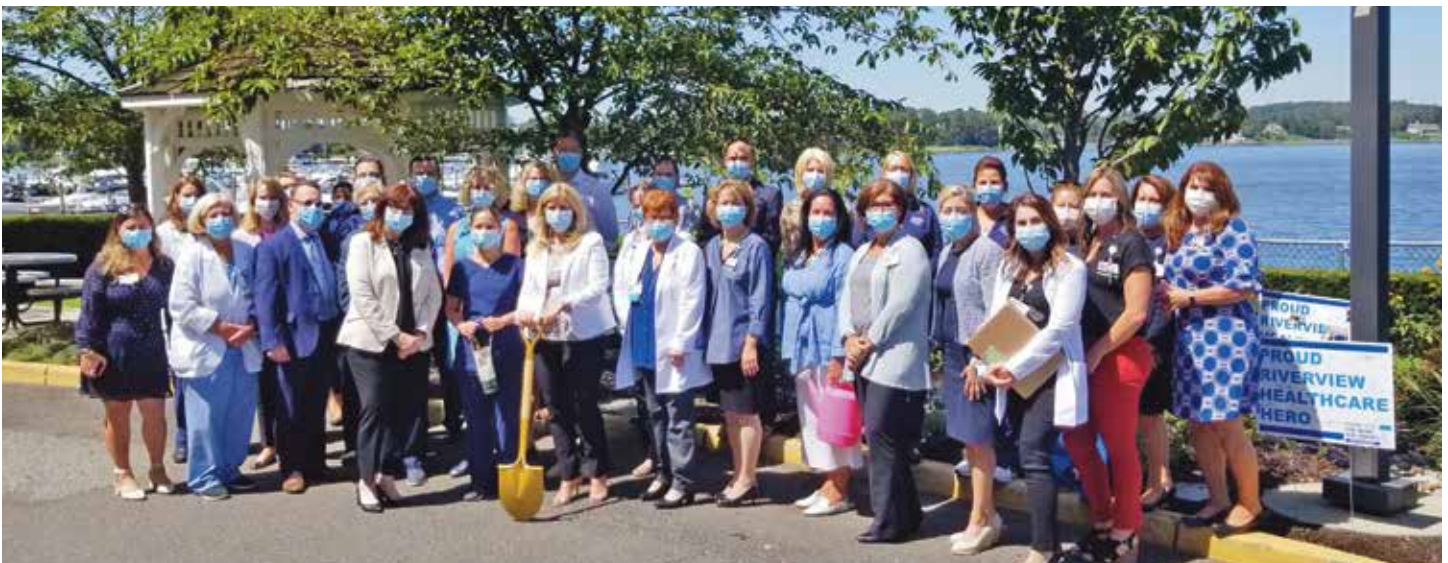
Day of Remembrance at Riverview Medical Center