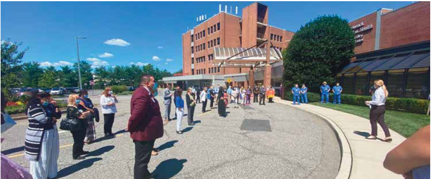
Day of Remembrance at Pascack Valley Medical Center