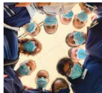
The cohort of graduate nurses at Raritan Bay Medical Center.

In October, Palisades Medical Center celebrated its first graduating class of