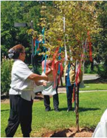
Day of Remembrance at JFK Hartwyk at Oak Tree