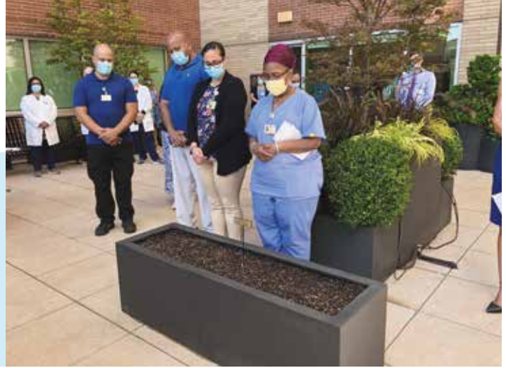
Day of Remembrance at Hackensack University Medical Center

In August, Hackensack Meridian Health held a Day of Remembrance across the network to honor those team members we lost and reflect on all we have overcome during the pandemic. A moment of silence was observed, and special events were planned at each campus.