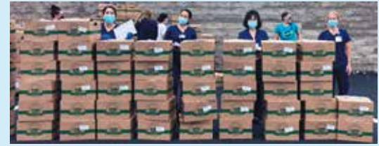
Through the Health Awareness Regional Program, Hackensack University Medical Center nurses distributed more than 2,000 boxes of food in the summer of 2020, totaling 17,000 pounds of fresh produce.

Other HARP programs include: Taking Control: Chronic Disease Self-Management and Diabetes Chronic Disease Self-Management; Project Healthy Bones for older women and men who have or are at risk for osteoporosis; and A Matter of Balance, which provides a comprehensive approach to maximizing activity