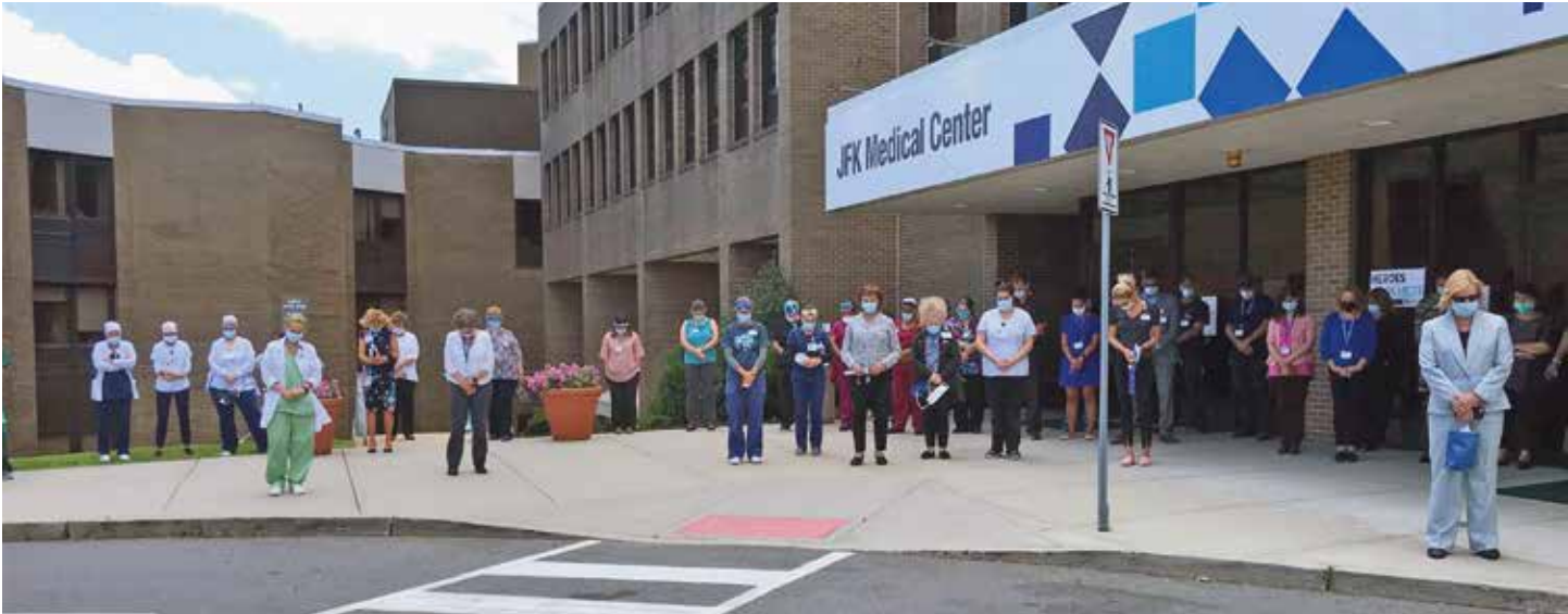
Day of Remembrance at JFK Medical Center