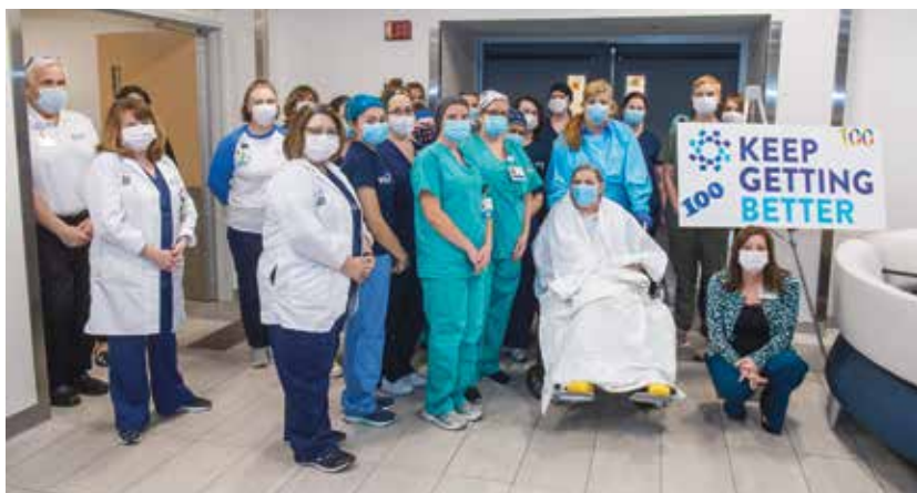
Southern Ocean Medical Center celebrated the discharge of the 100th COVID-19 patient in early May. As patients are discharged, team members celebrate the courage, strength and hope of our patients with "Here Comes the Sun" by the Beatles playing overhead.

**Excludes Pascack Valley and Mountainside Medical Centers.