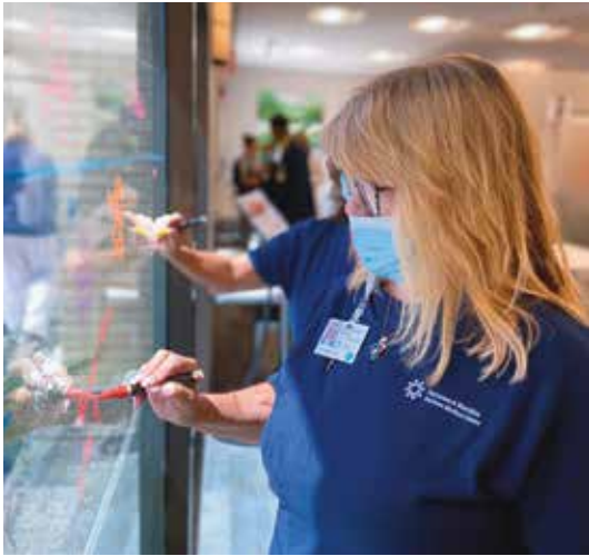
Day of Remembrance at Bayshore Medical Center